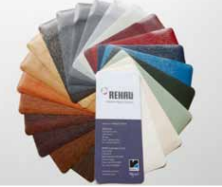
Visit www.rehauhome.com/colourselector to see how colour could enhance your home

Our Acryl II coating system offers over 150 RAL colours with a beautifully smooth finish. The finish has an impeccable pedigree having originally been developed many years ago by the REHAU Automotive division to produce colour matched bumpers for prestige cars such as Mercedes, BMW and Jaguar.